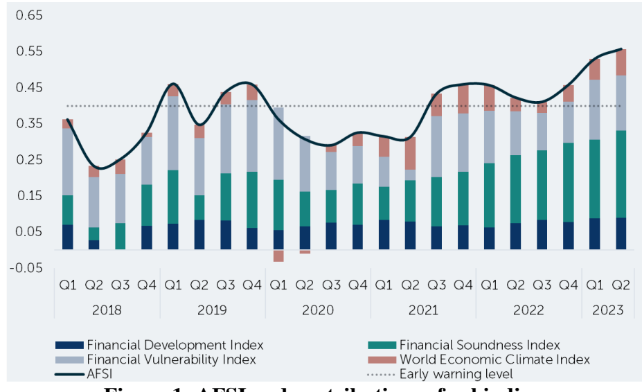
Figure 1: AFSI and contributions of subindices

The AFSI averaged 0.39 between 2018 and mid 2023 (figure 1). We set the AFSI benchmark at 0.4 as early warning level for the AFSI. This benchmark was set based on historical movements of this index, as is done in other studies. Hence, AFSI values above 0.4 are associated with relative financial solidity, while values below 0.4 signal increased vulnerabilities. Mid 2023, the AFSI stood at 0.56. The improvement in the AFSI as of 2021 was driven by the solidity of the local banking sector reflected in the financial soundness subindex.