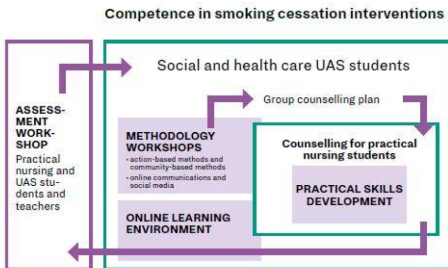
Picture 1: Project framework for increasing the smoking prevention and smoking cessation competence of social and healthcare students in higher education and in vocational education schools

The main idea in this pilot project implementation was that the social work and nurse students were teaching smoking prevention and smoking cessation for the practical nurses in vocational schools. The purpose was to support the peer learning, and to design and use creative, experiential and cooperative learning methods, which allow participants dealing their emotions and feelings connected to smoking. The idea in working was to find flexible and easy to apply methods to be used in teaching smoking prevention and smoking cessation, which fit especially for the young adults.