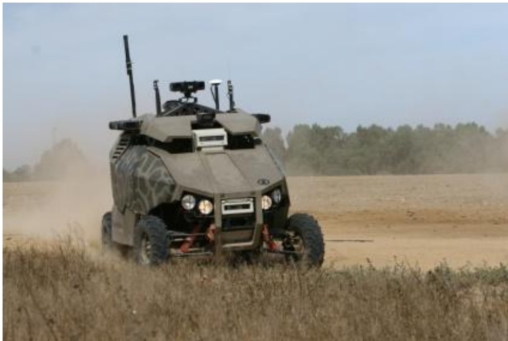
Figure 3. The Guardium Mk I by G-NIUS, an example of a modern semi-autonomous surveillance vehicle. It is operationally deployed by the Israeli Army ([5]).

military installations. The UGV should be able to move outdoors, in normal roads with small bumps, offering sufficient range and autonomy. The aim was to come up with a functional vehicle, which would be used as a prototype for demonstration, evaluation and testing of various subsystems and further upgrades. Following these guidelines, a tricycle design was chosen, which is more simple and easy to construct than the standard four wheel approach, while it can be used without a differential and a suspension system.