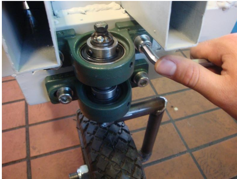
Figure 5. The steering wheel column, fixed with the help of two bearings on the front end of the chassis. The analog servomotor used for steering is connected to the top of the steering column.

During field testing, the vehicle was able to move at the speed of 10 km/h, the turning radius was 2,2 m and it was able to overcome obstacles up to 15 cm. The current consumption was 2,5 A at idle, 8,5 A when cruising and 18 A during acceleration. A conservative approach would yield an autonomy of 3,5 hours. Please note that in the current configuration, the netbook uses its own battery, limiting respectively the system autonomy.