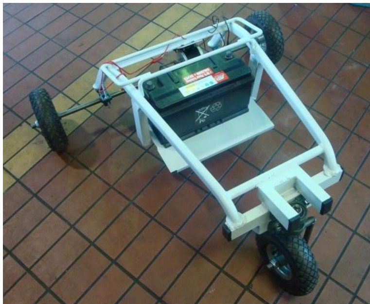
Figure 4. Kerveros I chassis with wheels and battery. The main DC motor can be seen just behind the battery.

Concerning the electronic parts, the "heart" of the control system is the main control board Arduino Uno , a low-cost board commonly found in remote controlled applications. It is based on a microcontroller running at 16 MHz, which can be connected to a PC via USB and programmed in C language. It offers several I/O connections, both digital (using Pulse Width Modulation) and analog. Several add-on modules can be connected to this board, offering features like Wi-Fi communication, GPS, various sensors etc, as will be discussed later.