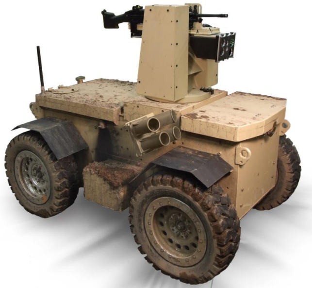
Figure 7. The Gladiator TUGV (Tactical UGV), developed by the National Robotics Engineering Consortium of the Robotics Institute of Carnegie Mellon University, in partnership with BAE Systems, for the US Marine Corps [8]. Equipped with cameras, GPS,