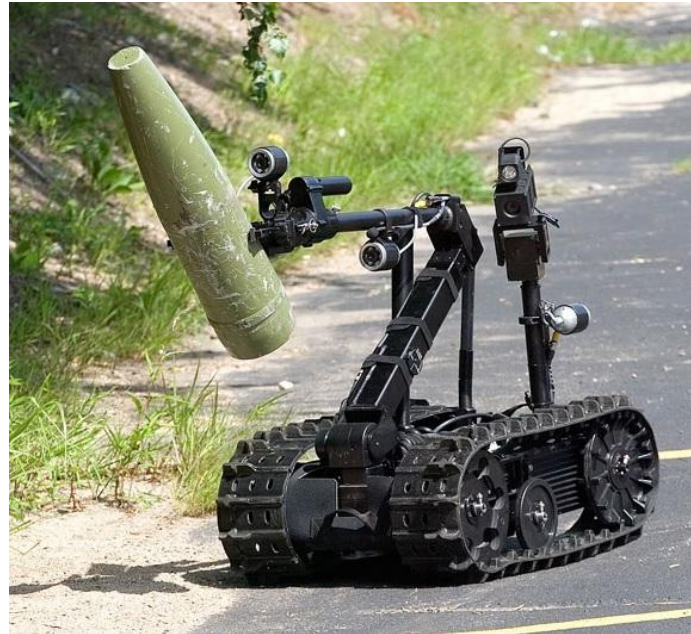
Figure 2. The well known QinetiQ North America's (ex Foster-Miller) TALON. Initially deployed in 2000, the TALON family of robots has been widely used for various tasks, such as improvised explosive device (IED) and explosive ordnance disposal (EOD), reconnaissance, communications, CBRNE (Chemical, Biological, Radiological, Nuclear, Explosive) missions etc ([4]).

The future technological challenge lies undoubtedly in the pursuit of increasing autonomy of UGVs. It should be emphasized that the successful design and operation of a UGV depends largely not only on the development of the corresponding technologies, that should cover several different disciplines, but primarily on the ability and successful introduction and integration of these technologies into the same platform. The variety of technologies includes, without limiting to, navigation systems, communications systems, power supply systems and power engineering, various types and classes of sensors, fault diagnosis, and also weapon systems, which should be operated and reloaded without human intervention.