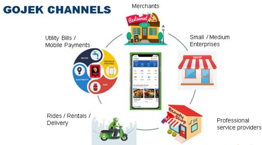
Figure 3: GO-JEK current channels