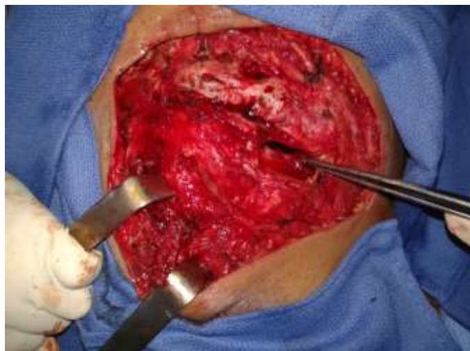
Figure 3: operative view showing the cavity of the hydatid bone abscess (patient in supine position, his head at the top)