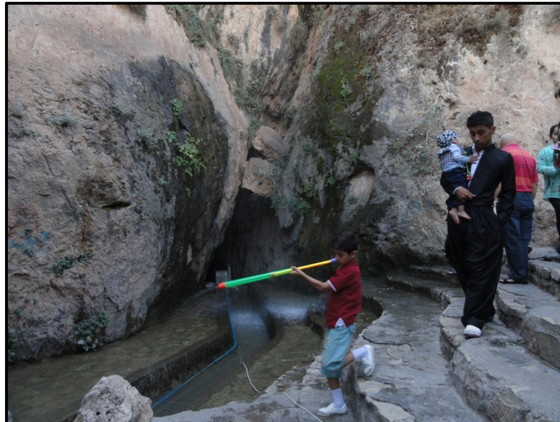
Fig.7: Jundiyan spring. Note the outlet of the cave through which the water flows out of the karst cave within the constructed concrete ditch.

Only small bungalows are available to the tourists as a rest sites, others sell daily requirements and food to the tourists. It can be reached through a paved road.