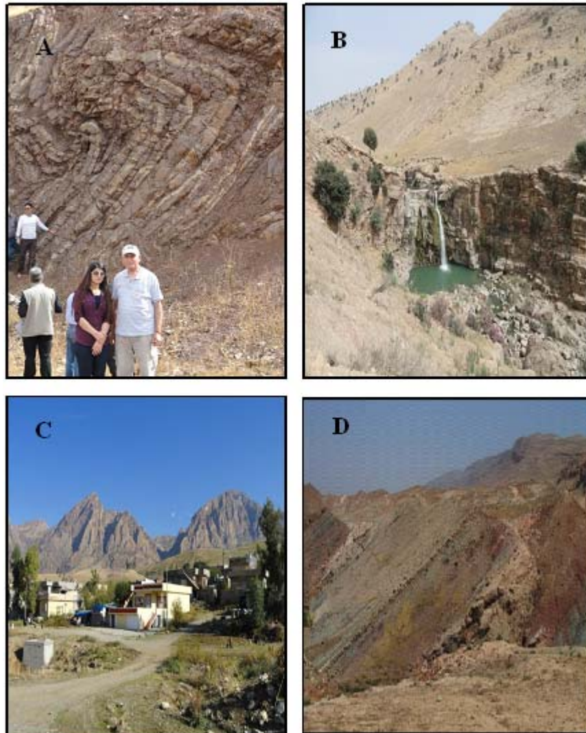
Fig.17: Suggested sites for tourism geology

sources for tourism geology. But, they need a lot of infrastructure before being in use.