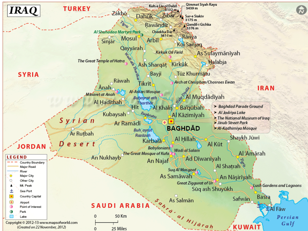
Figure 1: Iraq.

No brochures concerning the geology of the touristic sites are available for public. Tourism Geology is not included in the syllabuses of Geology Departments in universities. Therefore, this article can be considered as the first attempt to establish the principles of the “Tourism Geology” or Geotourism in Iraq.