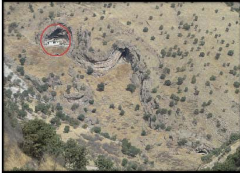
Fig.17: single house built under the folded massive carbonate beds of the Qamchuqa Formation

Another unique and significant site is shown in Fig. (17). A single house is built within the massive carbonates of the Qamchuqa Formation utilizing the folding of the beds. The owner of the house uses it as a rest site during vacations.