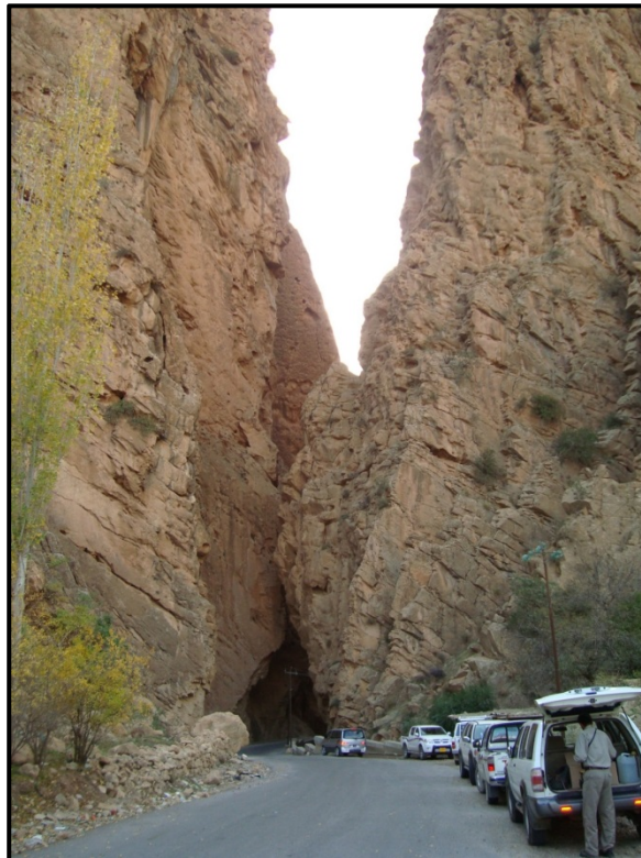
Fig.10: A narrow passage due to karst form within the Pila Spi Formation, behind the passage the Sartaq Bammu touristic site is located

6- Shanidar Cave: Shanidar Cave is an archaeological site located within Bradost Mountain in Iraqi Kurdistan [11]. The remains of ten Neanderthals, dating from 35,000 to 65,000 years ago, have been found within the cave. The cave also contains two later "proto-Neolithic" cemeteries, one of which dates back about 10,600 years and contains 35 individuals [5].