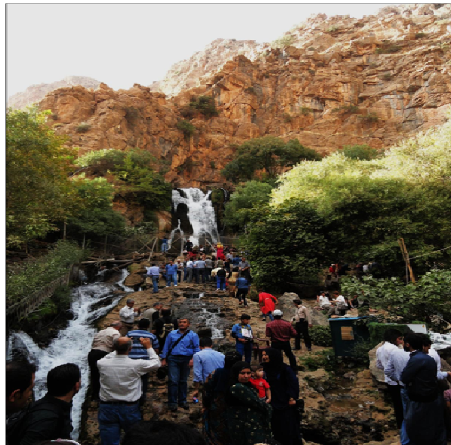
Fig.9: Ahmed Awa spring flowing enormous amount of fresh water through massive beds of Avroman Limestone (Triassic), most probably due to fractures after faulting

The water flows from a fracture zone within the massive limestone (Fig.9). Only small bungalows are available for tourists rest and providing daily requirements for the tourists. It can be reached through a paved road.