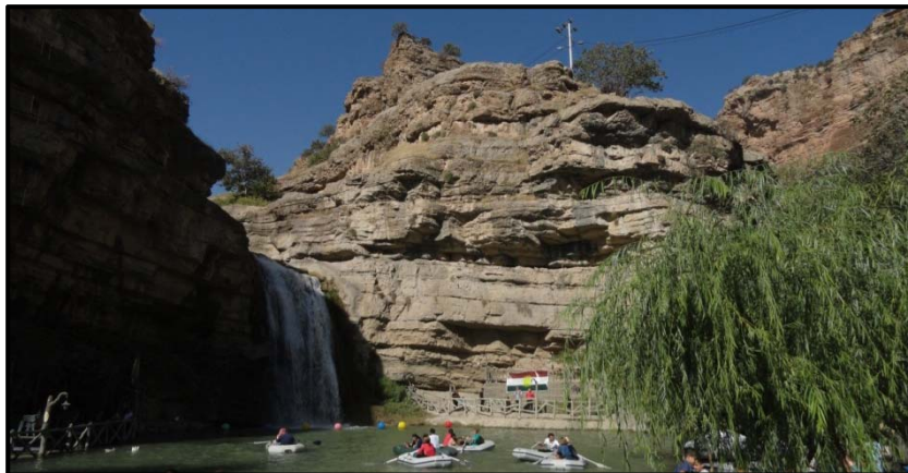
Fig.2: Galley Ali Beg Waterfall

1- Galley Ali Beg Waterfall: This is one of the largest waterfall within the touristic sites (Fig.2). Its height is about 11 m, developed within the massive limestone rocks [8] of the Qamchuqa Formation of Lower Cretaceous age [3]. The valley (Khliafan Stream) has canyon shape with height difference between the lowest and highest elevations being about 1000 m (Fig.3). The galley itself has very unique geological interest, since the water flows in the gorge from two opposite directions; from the north and south, the two streams merge together somewhere in the middle of the gorge, then they leave the gorge by another one which has almost perpendicular direction to the main gorge (Fig.4) [9]. It can be reached through a paved road.