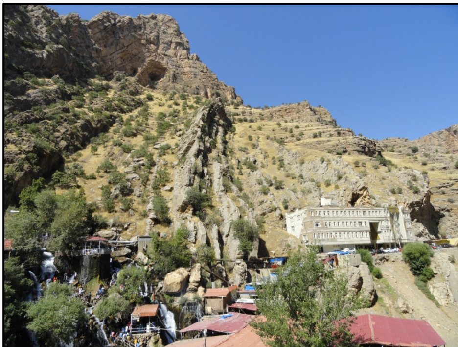
Fig.6: Bekhal springs. Note the well bedded, faulted and karstified carbonate beds, also the recently built hotel with other bungalows.

3- Jundiyan Spring: : A spring that flows out of a deep karst cave. The depth is unknown. The spring has a very special and unique case, since the water flows out of the cave (Fig.7) for few hours or days; then stop flowing for few hours or days and flows back again, and so on. When the water starts flowing out of the cave, roaring sound can be heard accompanied with the flow of the water indicating that the water will be out of the cave. According to the local people,