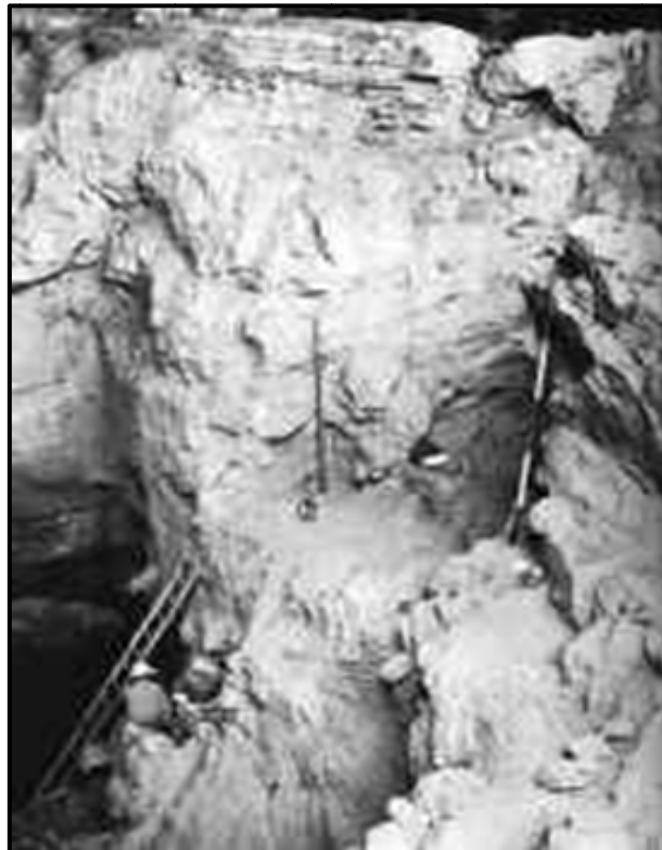
Fig.15: Archeological excavations carried out in Shanidar cave. Note the solution traces in the walls of the hole

The others (Shanidar 1, 2, and 4 – 8) were kept in Iraq and may have been lost during the 2003 invasion, although casts remain at the Smithsonian [4]. In 2006, while sorting a collection of faunal bones from the site at the Smithsonian, Melinda Zeder discovered leg and foot bones from a tenth Neanderthal, now known as Shanidar 10 [6]. The ten Neanderthals at the site were found within a Mousterian layer which also contained hundreds of stone tools including points, side-scrapers, and flakes and bones from animals including wild goats and spur-thighed tortoises [13].