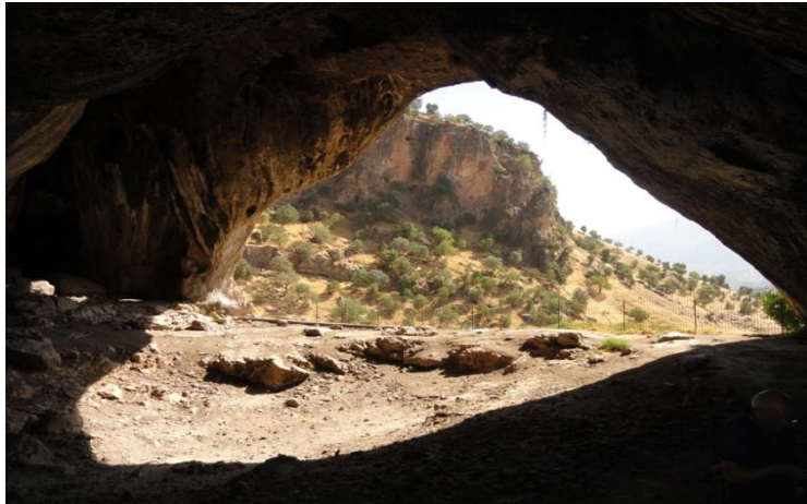
Fig.11: The entrance of Shanidar cave (view from inside)