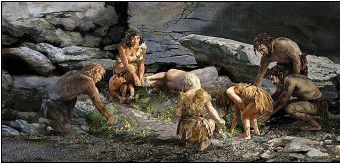
Fig.16: Spectacular drawing for burial ceremony in Shanidar cave. Note the flowers and other plants around the grave

Solecki [12] described Shanidar cave as “Shanidar Cave is in a mountain called Baradost, overlooking Shanidar Valley. From the cave mouth one can see the Greater Zab River, a tributary of the Tigris. The cave, now some 2,500 feet (about 760 m) above sea level, was dissolved out of the mountain's limestone rock, originally laid down by an ancient sea. It has a flat earthen floor, about 11,700 square feet (about 1070 m 2 ) in area, and a high ceiling (45 feet at the highest point, about 13.5 m) blackened with a centuries-old deposit of soot”.