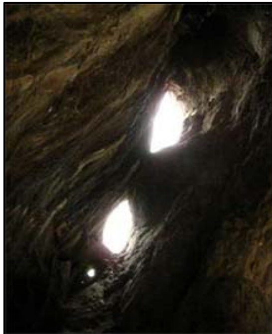
Fig.14: Two holes in the ceiling of Shanidar cave (may be artificially opened by living Neanderthal)