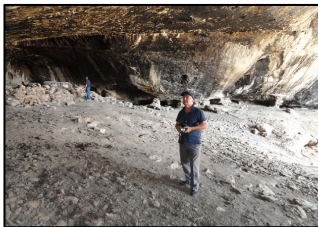
Fig.12: Inside of Shanidar cave. Note the excavation debris on the floor. The black color is due to burning of wood during winter by local shepherds.