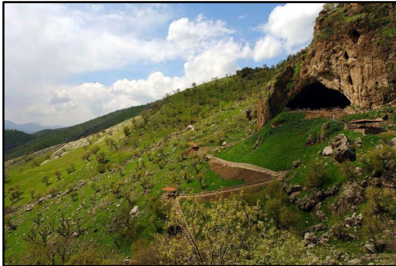
Fig.13: Outside view of Shanidar cave. Note the artificial ladder and the wooden rest stations along the way to the cave