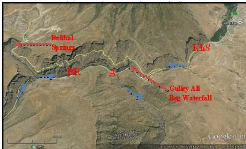
Fig.4: Google Earth image (facing south). Note the merging of the Khlaifan stream (KhS) into the Rawandouz River (RR), before leaving the gorge at point (A)