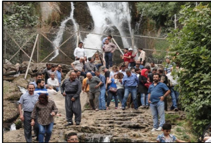
Fig.8: Ahmaed Awa Spring

The water flows from a fracture zone within the massive limestone (Fig.9). Only small bungalows are available for tourists rest and providing daily requirements for the tourists. It can be reached through a paved road.