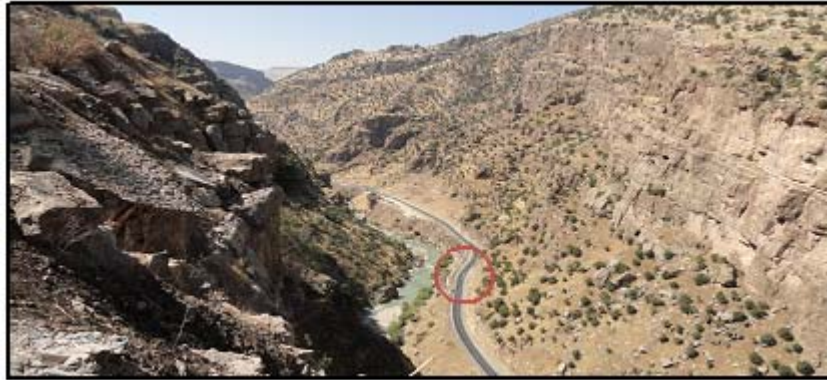
Fig.3: Galley Ali Beg gorge. Compare the width of the road and the encircled cars (by red color) with the height of the gorge