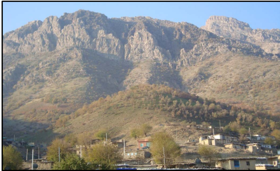
Fig.10: Sartaq Bammu site nearby to Iraqi – Iranian borders

The best known of the Neanderthals are Shanidar 1 , who survived several injuries during his life, possibly due to care from other members of his band, and Shanidar 4 , whose body lay beside a flower that can either be explained as evidence of burial rituals or animal contamination.