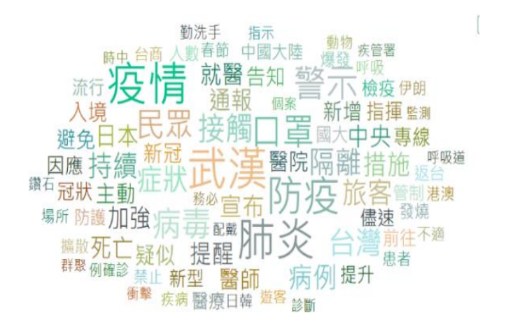
Figure 3: Trending topics after January 11, 2020

Next, we take the event day to examine whether abnormal returns existed before or after the event. This study takes January 11, 2020, as an event day that this date, the social networks issue has changed from concern regarding traveling to how to avoid