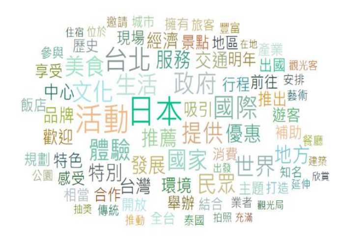
Figure 2: Trending topics before January 11, 2020

To verify the date of the reversal point, this study uses KEYPO big data search engine system (KEYPO) to examine the different accumulations of positive and negative social network volume; the reversal point occurred after January 11, 2020. Next, we assumed this date as an event day by analyzing the most popular topics in terms of social network volume before and after the event day. This allows us to investigate which issues people were most concerned about. Figures 2 and 3, shows that the most popular topics changed from the countries people expect to the relevant medical accessories to prevent infection.