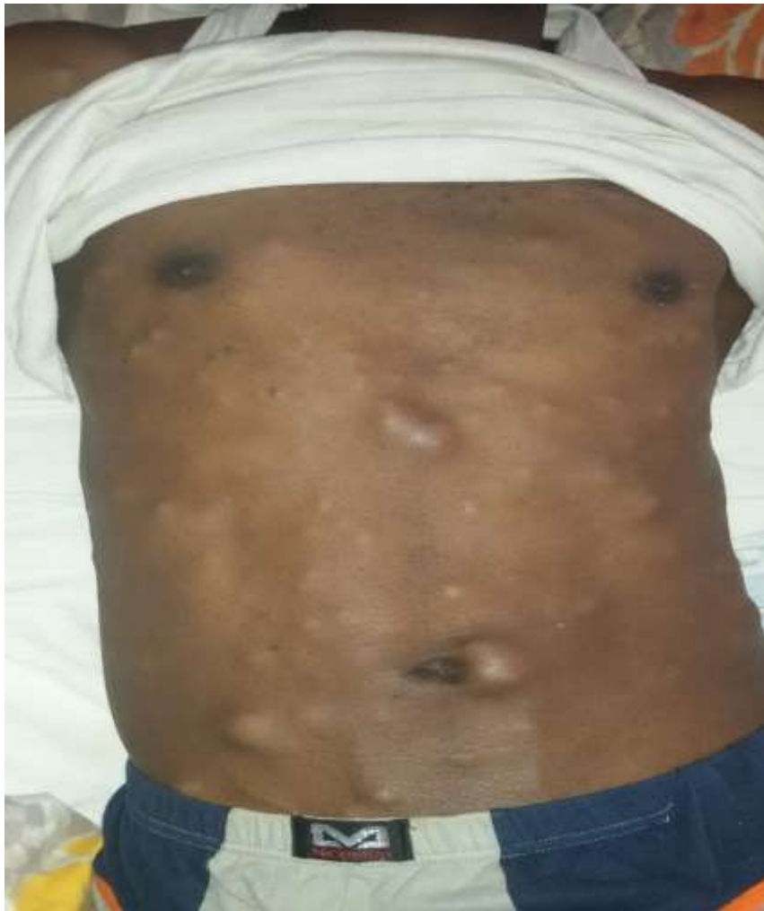
Figure 1 : Cutaneous and Subcutaneous nodules on the anterior abdominal wall

He was admitted and commenced on haemodialysis to optimize him for a possible urinary diversion and chemotherapy. During this period one of the subcutaneous nodules was taken for histology which came out to be subcutaneous metastatic transitional carcinoma (Fig 3a and 3b). He however deteriorated and died.