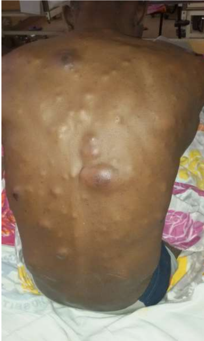
Figure 2: Cutaneous and Subcutaneous nodules on the posterior abdominal wall