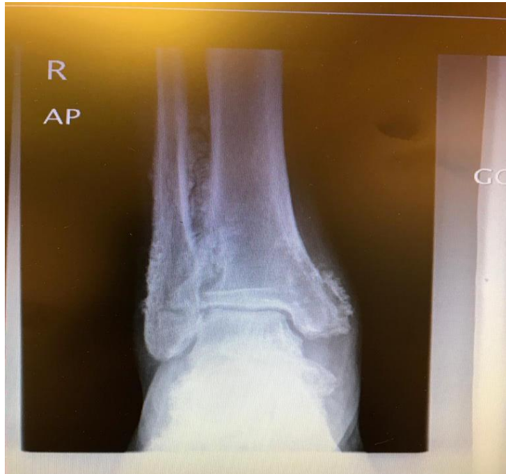
Figure 4: X-ray of the ankle joint showing heterogeneous irregular periosteal calcification seen along the diaphyseal and metaphyseal regions of the tibia and fibula.

The X-ray of the chest (PA view) showed clear lungs fields, normal hilar shadows, clear cardiophrenic, and costophrenic angles. No evidence of pleural effusion was observed. The Cardiac shadow had a normal limit and the Thoracic cage was unremarkable.