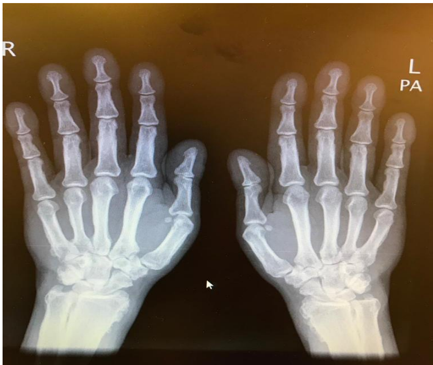
Figure 1: X-Ray of hands shows the subperiosteal new bone formation and bilateral clubbing of fingers

The X-ray image of the knee joints showed heterogeneous irregular periosteal calcification along the diaphyseal and metaphyseal regions of the tibia and femur.