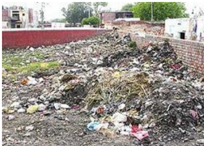
Figure 4: Polythene bags disposal in Mbarara Municipality