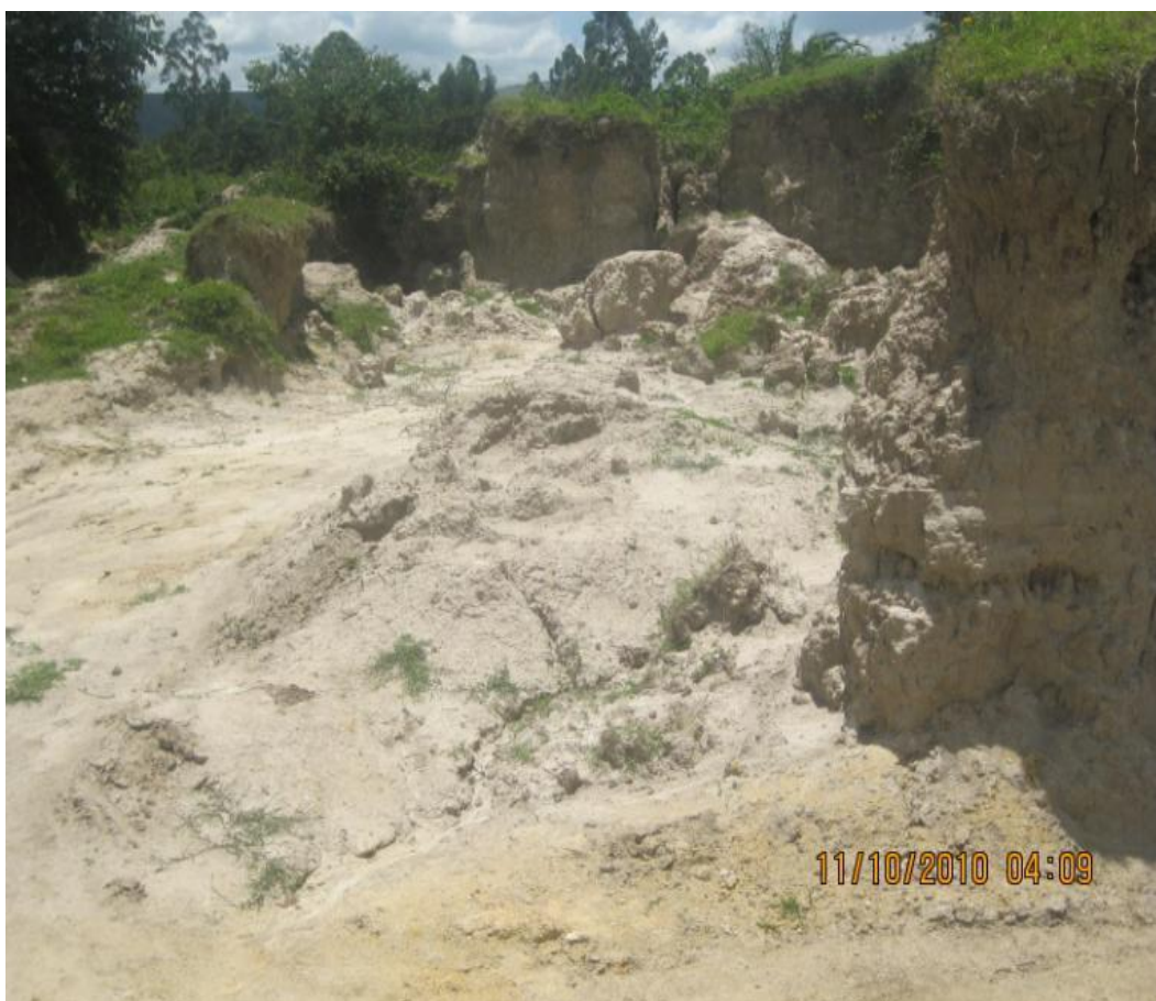
Figure 3: Land degradation due to sand mining in Nyeihanga - Mbarara District

In Uganda where land is a critical factor in both natural and human management production systems, 130 million ha of lands are seriously touched by this phenomenon. The researchers observed scenes of land degradation that included overgrazing, sand extraction as was the case in Nyeihanga, and uncontrolled planting. All these contribute to climate change in a way that they either lead to extreme flooding, strong winds and or soil erosion.