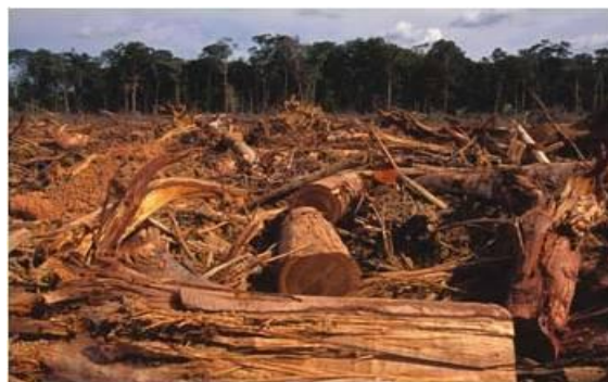
Figure 2: Deforestation in Bushenyi

The accelerating destruction of the rainforests that form a precious cooling band around the Earth's equator is now being recognized as one of the main causes of climate change. Forests generate the bulk of rainfall worldwide and act as a thermostat for the Earth. When they are felled or burned, the carbon dioxide stored by the trees escapes back into the air hence creating change in climate. Equally, trees contribute to the formation of convectional rainfall. Without these trees, rainfall will either reduce or won't be there. The researchers were able to observe scenes of deforestation. Some people interviewed also attributed the changes in climate to the continuous and indiscriminate cutting of trees.